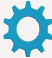
Device Settings & Profile Management