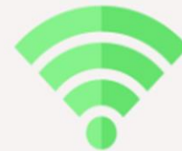
Wi-Fi and VPN & Certificate Management