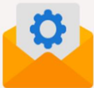
Email management & Messaging