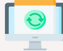
Software update Management