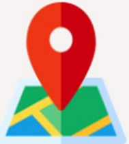
Location Tracking & Geo-fencing