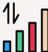
Data Usage Management