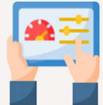
Control & Monitor