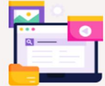
Content Management & Content Sharing