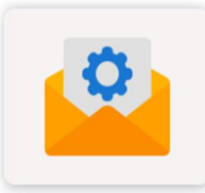
Email management & Messaging